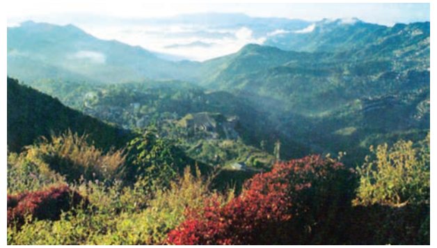
Figure 2.4 : Mizo Hills

The Brahmaputra marks the eastern-most boundary of the Himalayas. Beyond the Dihang gorge, the Himalayas bend sharply to the south and spread along the eastern boundary of India. They are known as the Purvachal or the Eastern hills and mountains. These hills running through the north-eastern states are mostly composed of strong sandstones, which are sedimentary rocks. Covered with dense forests, they mostly run as parallel ranges and valleys. The Purvachal comprises the Patkai hills , the Naga hills , the Manipur hills and the Mizo hills.