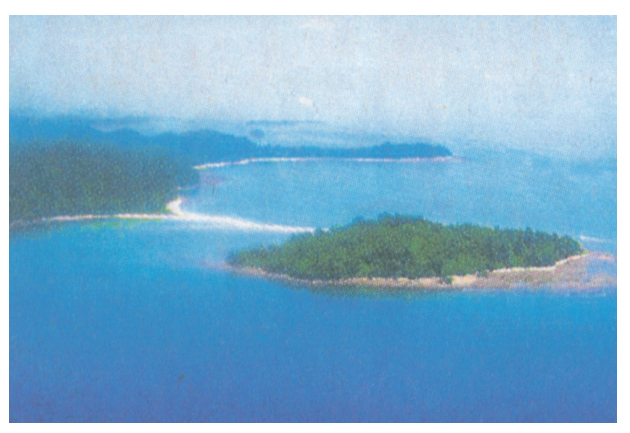
Figure 2.9 : An Island

You have already seen that India has a vast mainland. Besides this, the country has two groups of islands. Can you identify these island groups?