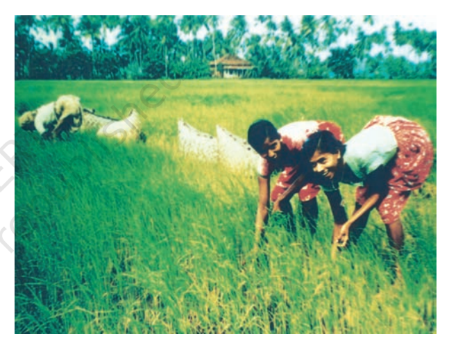
Figure 2.8 : The Coastal Plains

The Peninsular plateau is flanked by stretch of narrow coastal strips, running along the Arabian Sea on the west and the Bay of Bengal on the east . The western coast , sandwiched between the Western Ghats and the Arabian Sea, is a narrow plain. It consists of three sections. The northern part of the coast is called the Konkan (Mumbai – Goa), the central stretch is called the Kannad Plain , while the southern stretch is referred to as the Malabar coast .