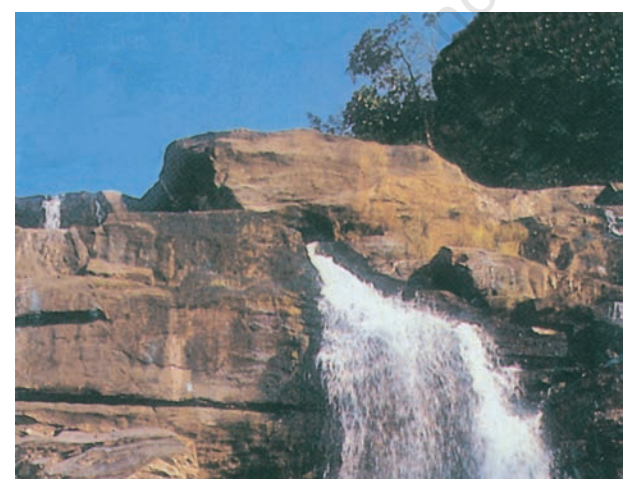
Figure 2.6 : A Waterfall in Chotanagpur Plateau

The Peninsular plateau is a tableland composed of the old crystalline, igneous and metamorphic rocks. It was formed due to the breaking and drifting of the Gondwana land and thus, making it a part of the oldest landmass. The plateau has broad and shallow valleys and rounded hills. This plateau consists of two broad divisions, namely, the Central Highlands and the Deccan Plateau. The part of the Peninsular plateau lying to the north of the Narmada river, covering a major area of the Malwa plateau, is known as the Central Highlands. The Vindhyan range is bounded by the Satpura range on the south and the Aravalis on the northwest. The further westward extension gradually merges with the sandy and rocky desert of Rajasthan. The flow of the rivers draining this region, namely the Chambal, the Sind, the Betwa and the Ken is from southwest to northeast, thus indicating the slope. The Central Highlands are wider in the west but narrower in the east. The eastward extensions of this plateau are locally known as the Bundelkhand and Baghelkhand.