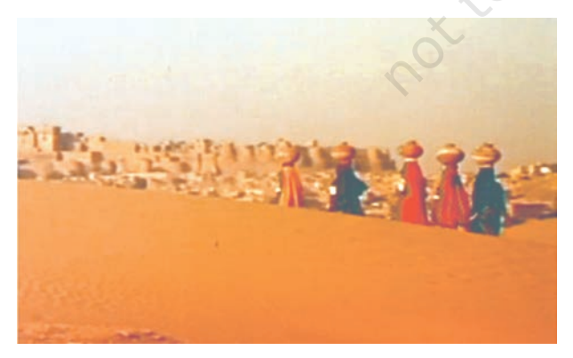
Figure 2.7 : The Indian Desert

The Indian desert lies towards the western margins of the Aravali Hills. It is an undulating sandy plain covered with sand dunes. This region receives very low rainfall below 150 mm per year. It has arid climate with low vegetation cover. Streams appear during the rainy season. Soon after they disappear into the sand as they do not have enough water to reach the sea. Luni is the only large river in this region.