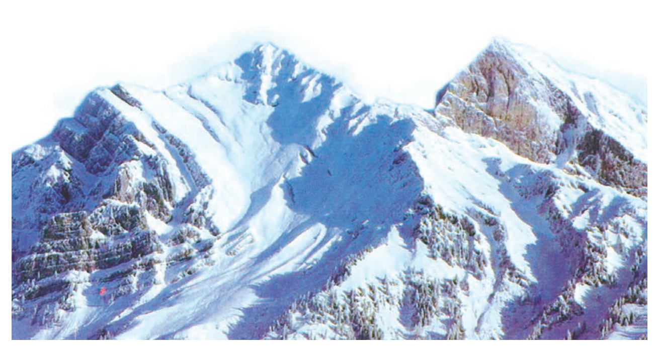
Figure 2.3 : The Himalayas

of 10-50 Km and have an altitude varying between 900 and 1100 metres. These ranges are composed of unconsolidated sediments brought down by rivers from the main Himalayan ranges located farther north. These valleys are covered with thick gravel and alluvium. The longitudinal valley lying between lesser Himalaya and the Shiwaliks are known as Duns. Dehra Dun, Kotli Dun and Patli Dun are some of the well-known Duns.