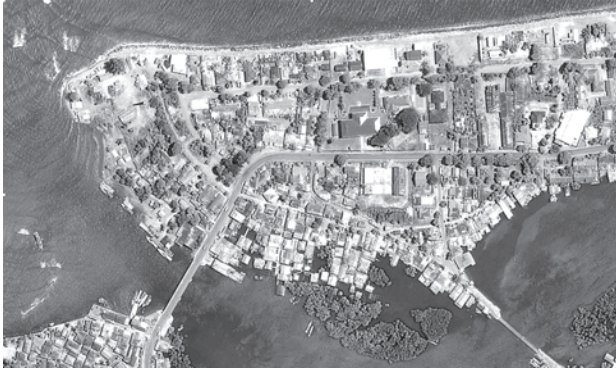
Band Aceh, June, 2004