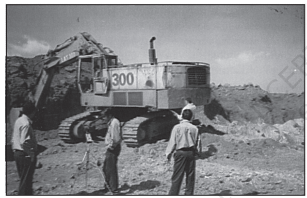
Fig. 12.2 : Noise monitoring at Panchpatmalai Bauxite Mine

The main sources of noise pollution are various factories, mechanised construction and demolition works, automobiles and aircraft, etc. There may be added periodical but polluting noise from sirens, loudspeakers used in various festivals, programmes