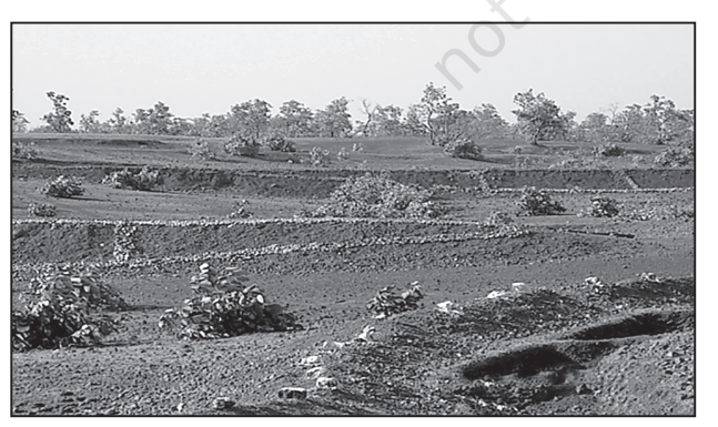
Fig. 12.4 : Trees planted on Common Property Resources in Jhabua

An interesting aspect of this experience is that before the community embarked upon the process of management of the pasture, there was encroachment on this land by a villager from an adjoining village. The villagers called the tehsildar to ascertain the rights of the common land. The ensuing conflict was tackled by the villagers by offering to make the defaulter encroaching on the CPR a member of their user group and sharing the benefits of greening the common lands/ pastures. (See the section on CPR in chapter 'Land Resources and Agriculture').