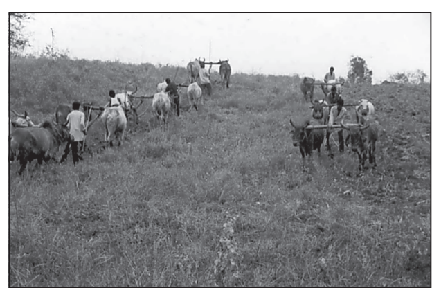
Fig. 12.5 : Community Participation for Land Leveling in Common Property Resources in Jhabua (ASA, 2004)