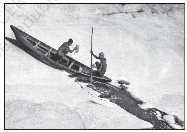
Fig.12.1 : Cutting Through Effluent : Rowing through a pervasive layer of foam on the heavily polluted Yamuna on the outskirts of New Delhi

Indiscriminate use of water by increasing population and industrial expansion has led degradation of the quality of water considerably. Surface water available from rivers, canals, lakes, etc. is never pure. It contains small quantities of suspended particles, organic and inorganic substances. When concentration of these substances increases, the water becomes polluted, and hence becomes unfit for use. In such a situation, the self-purifying capacity of water is unable to purify the water.