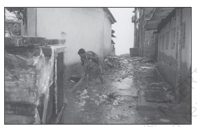
Fig. 12.3 : A view of urban waste in Mahim, Mumbai