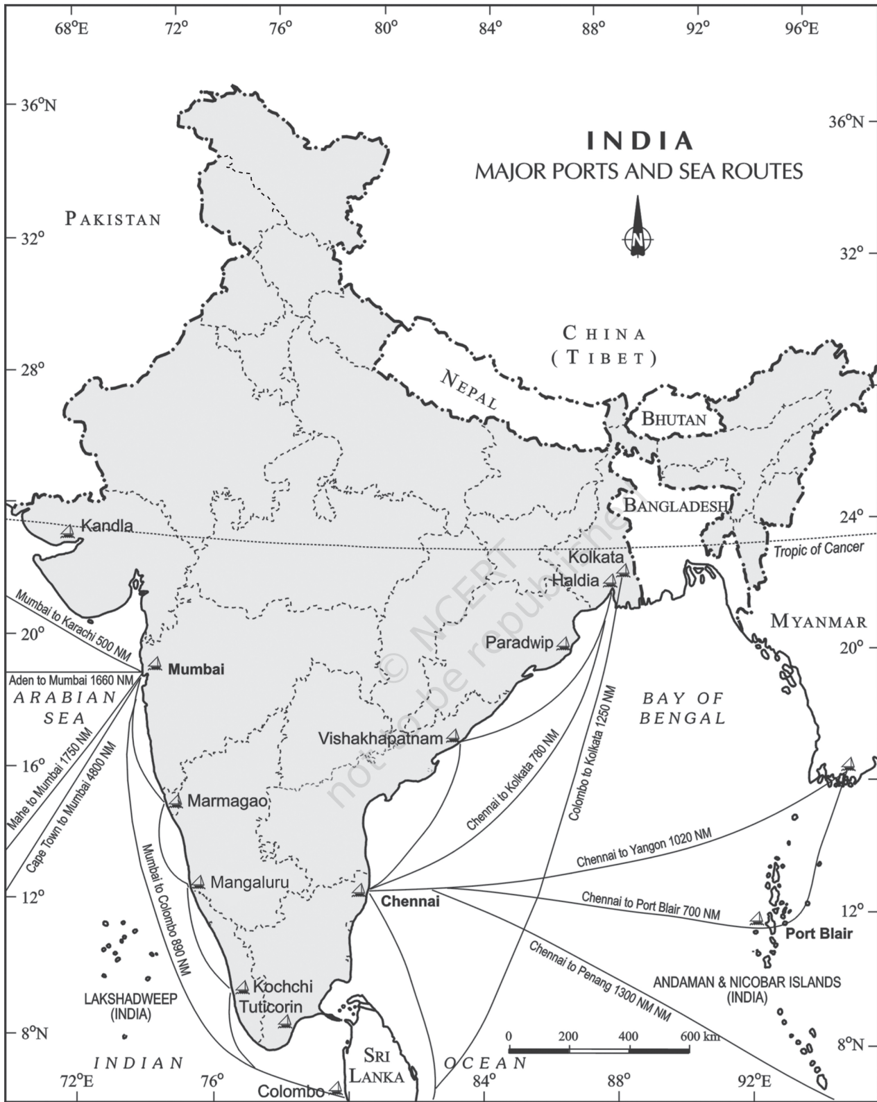
Fig. 11.4 : India – Major Ports and Sea Routes