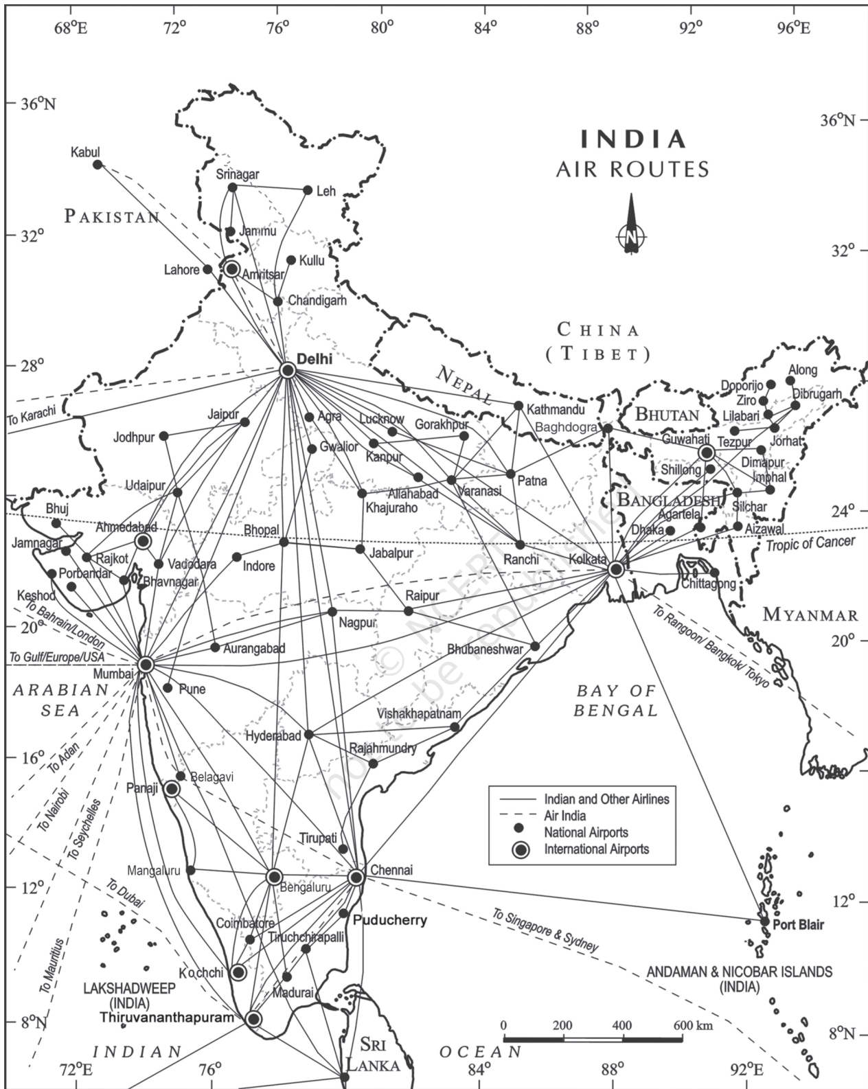
Fig. 11.5 : India - Air Routes