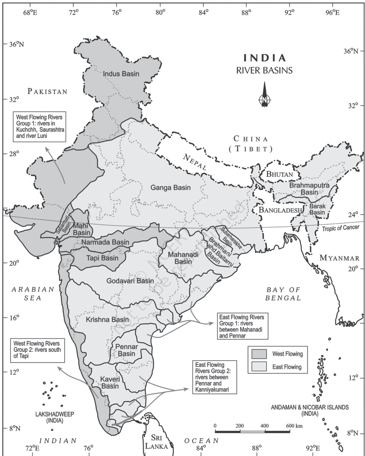
Fig. 6.1 : India - River Basins