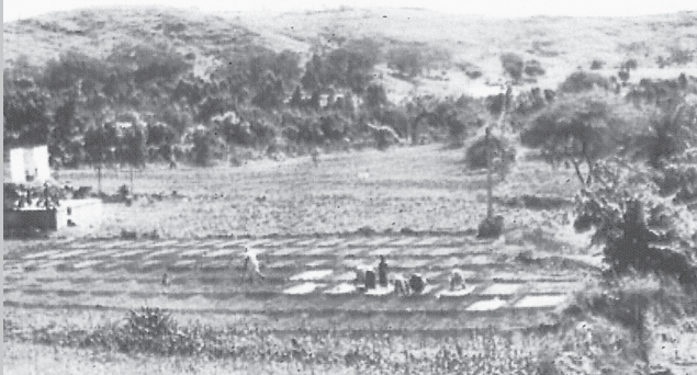
Ralegan Siddhi after mitigation approach

in agricultural operation. Landless labourers also gained employment. Today the village plans to buy land for them in adjoining villages.