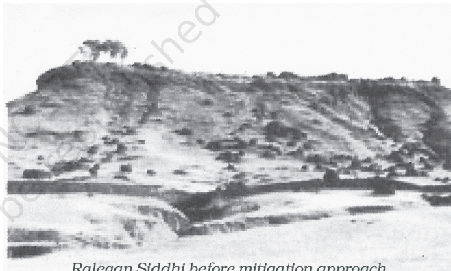
Ralegan Siddhi before mitigation approach

A Rs.22 lakh school building was constructed using only the resources of the village. No donations were taken. Money, if needed, was borrowed and paid back. The villagers took pride in this self-reliance. A new system of sharing labour grew out of this infusion of pride and voluntary spirit. People volunteered to help each other