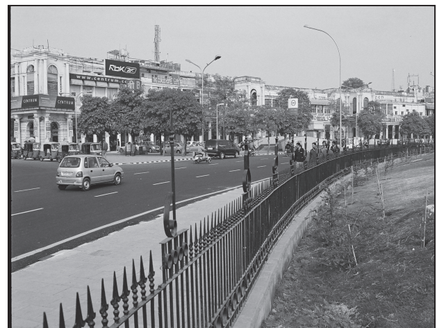
Fig. 4.4 : A view of the modern city

The British and other Europeans have developed a number of towns in India. Starting their foothold on coastal locations, they first developed some trading ports such as Surat, Daman, Goa, Pondicherry, etc. The British later consolidated their hold around three principal nodes – Mumbai (Bombay), Chennai (Madras), and Kolkata (Calcutta) – and built them in the British style. Rapidly