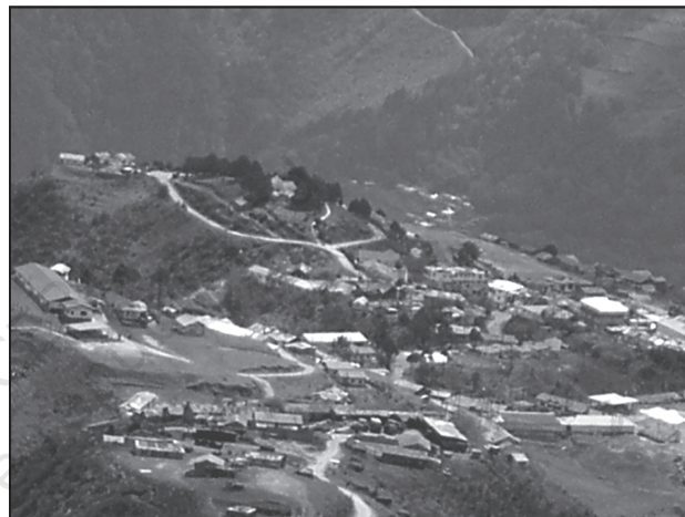
Fig. 4.2 : Semi-clustered settlements

Semi-clustered or fragmented settlements may result from tendency of clustering in a restricted area of dispersed settlement. More often such a pattern may also result from segregation or fragmentation of a large compact village. In this case, one or more sections of the village society choose or is forced to live a little away from the main cluster or village. In such cases, generally, the land-owning and dominant community occupies the central part of the main village, whereas people of lower strata of society and menial workers settle on the outer flanks of the village. Such settlements are widespread in the Gujarat plain and some parts of Rajasthan.