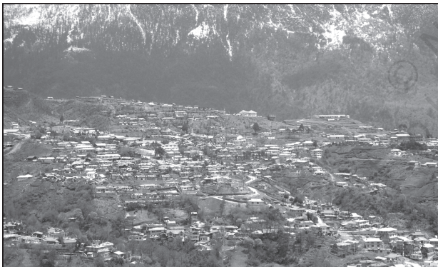
Fig. 4.1 : Clustered Settlements in the North-eastern states

The clustered rural settlement is a compact or closely built up area of houses. In this type of village the general living area is distinct and separated from the surrounding farms, barns and pastures. The closely built-up area and its