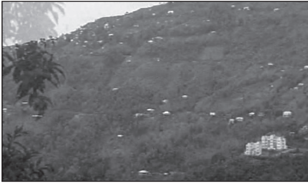
Fig. 4.3 : Dispersed settlements in Nagaland

with farms or pasture on the slopes. Extreme dispersion of settlement is often caused by extremely fragmented nature of the terrain and land resource base of habitable areas. Many areas of Meghalaya, Uttarakhand, Himachal Pradesh and Kerala have this type of settlement.