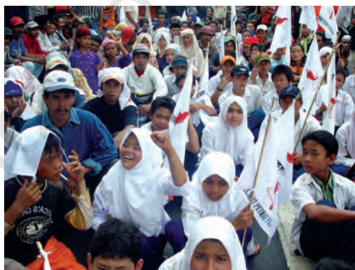
Land rights protest: farmers of West Java, Indonesia. In June 2004, about 15,000 landless farmers from West Java, travelled to Jakarta, the capital city. They came with their families to demand land reform, to insist on the return of their farms. Demonstrators chanted, "No land, No vote" declaring that they would boycott Indonesia's first direct presidential election if no candidate backed land reform.