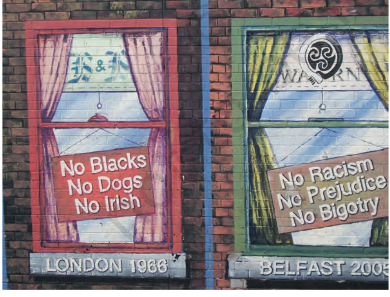
In some societies of Northern Ireland, the colonies of Protestant and Catholic communities are divided by walls. These walls are sometimes filled with graffiti as you can see here. The Irish Republican Army and British Government signed an agreement in 2005. What does the graffiti here tell about the conflict in the society?

Second, it depends on how political leaders raise the demands of any community. It is easier to accommodate demands that are within the constitutional framework and are not at the cost of another community.