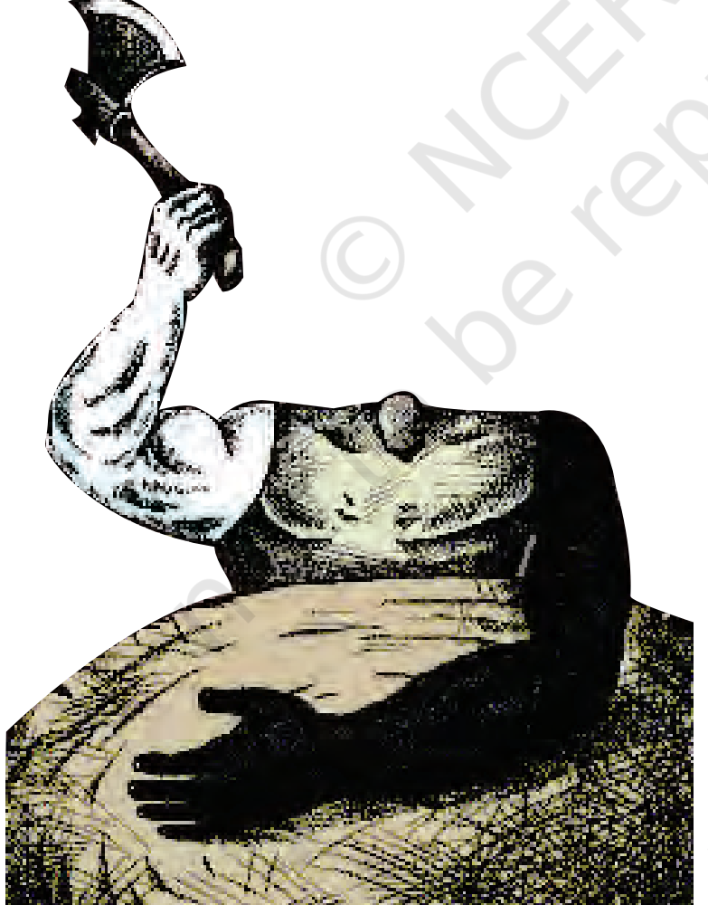
A cartoon like this can be read by different people to mean different things. What does this cartoon mean to you? How do other students in your class read this?

It is fairly common for people belonging to the same religion to feel that they do not belong to the same community, because their caste or sect is very different. It is also possible for people from different religions to have the same caste and feel close to each other. Rich and poor persons from the same family often do not keep close relations with each other for they feel they are very different. Thus, we all have more than one identity and can belong to more than one social group. We have different identities in different contexts.