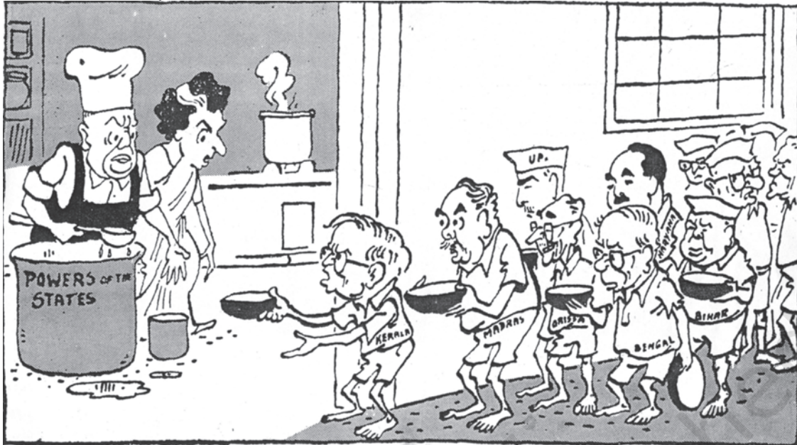
© Kuttu - Laughing with Kuttu